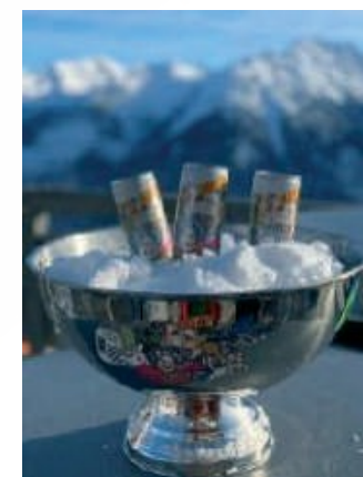
„Kiss me“ ICE BUCKET for 24 Cans