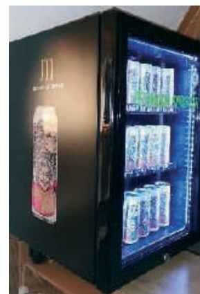
COOLER for 96 Cans